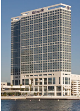
Hilton San Diego Bayfront, CEC's Headquarters Hotel

CONVENTION & EXPO APRIL 8-11 | SAN DIEGO, CA