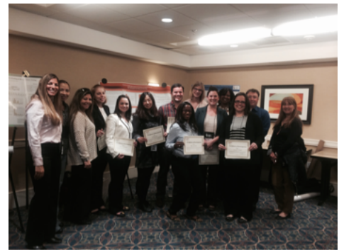
Participants of the 2014 DDEL Student Research Forum with members of the executive board.

If you would like assistance with the proposal writing process please do not hesitate to contact us at CECDDEL@gmail.com , to ensure that you meet the deadline, please request assistance in advance.